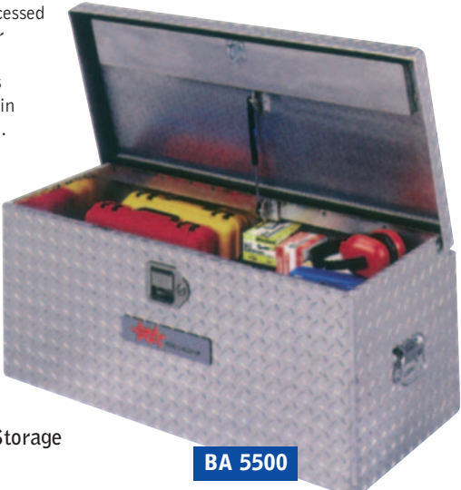
BA 5500 Aluminium Secure Storage Chest